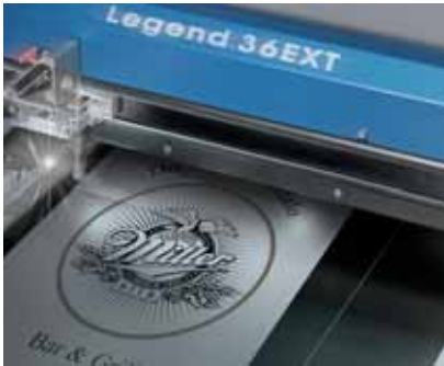
Laser engraved mirror